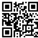
Car Show Entry

Car Show Smoked Meats Competition $10 Meat Sampler Plate